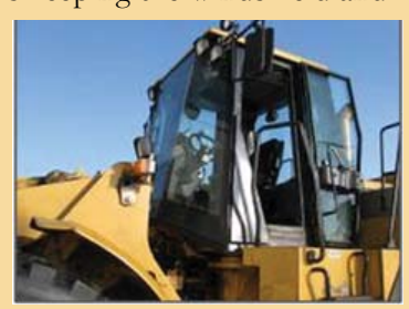
Basic loader wipers free of snow and ice buildup. Previously the operators

In the cold, snowy climate of Alaska the use of the snow loaders is a common sight. One of the biggest problems is keeping the windshield and