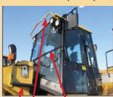
Upper and lower grab rails and step installed

They installed a platform to stand on, a top grab rail, a lower grab rail to hold onto and a lower step to hoist themselves up on. They also made the mirrors pivot upward